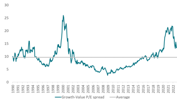
Chart 3: Valuation gap between Value and Growth stocks

As we go into 2023, we are neutral on Value because the valuation spread with Growth is now closer to its long-term average and with interest rates now close to peak levels, we do not expect the same de-rating headwinds for Growth stocks. However, we remain neutral on Value because while we may be close to peak rates, we also don’t expect rates to fall quickly. A more benign Value-Growth style environment should lead to improved conditions for stock selection.