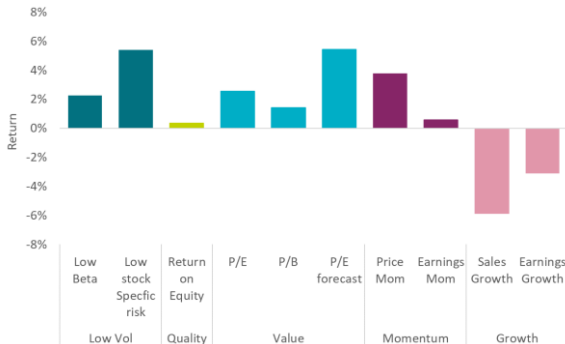
Chart 1: Global factor performance in 2022

However, as we move into early 2023, we have a more positive outlook because Quality tends to outperform when macro momentum is weak or slowing (as it is now) but also fares well in recovery phases - see Chart 2 .